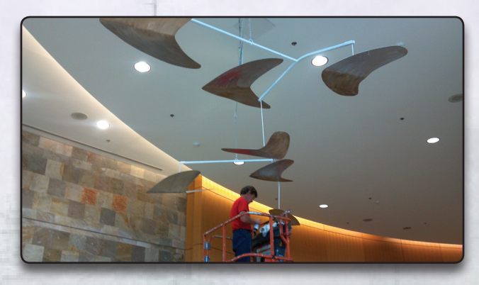
RT hanging 15' stainless steel mobile at UNC Chapel Hill

From small garden bugs and animals to more sculptural larger works, Camille has taken copper to a different level. Often humorous and never dull, she puts a little of her own personality into every work.