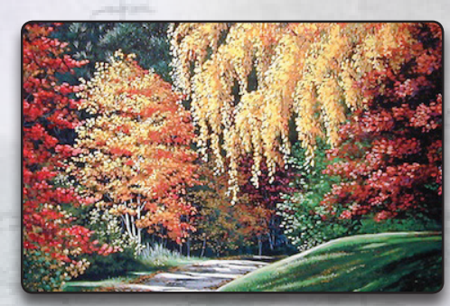
Follow Me to the River