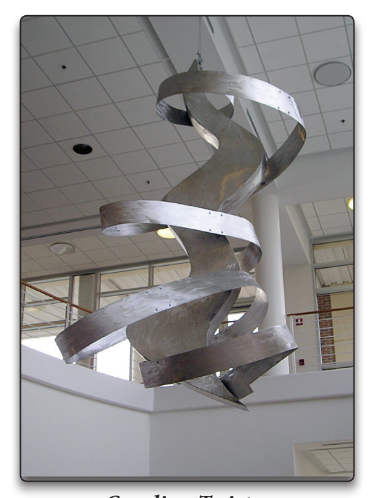
Carolina Twister 12' Stainless Steel