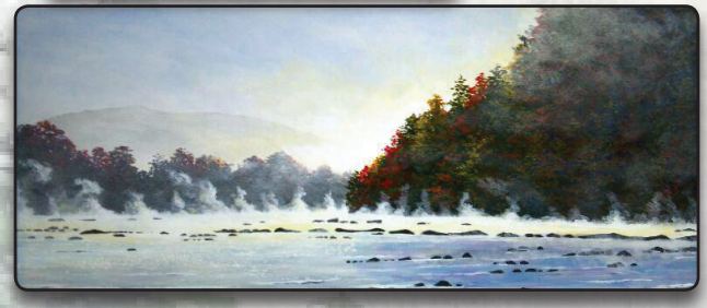
Morning on the New River 4' x 2' Acrylic